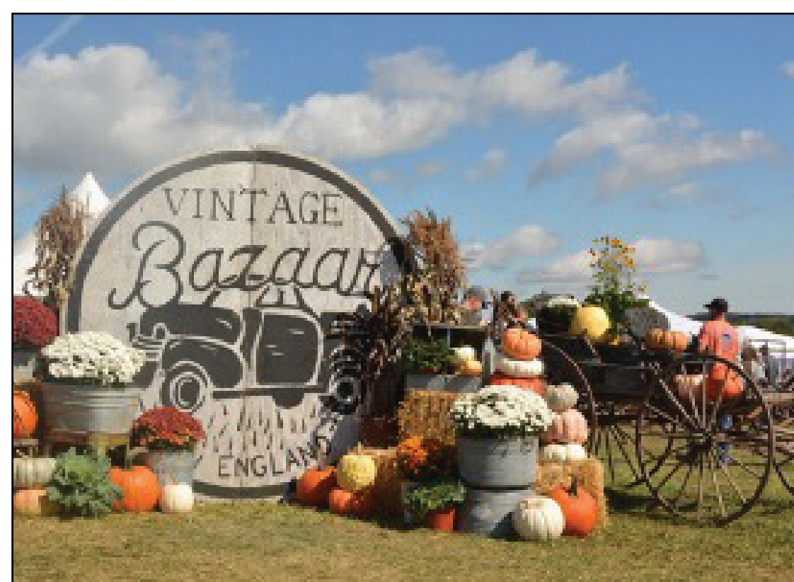
The Vintage Bazaar at Kimball Farm in Haverhill drew a crowd Oct. 5. Below, scenes from the fall festival.